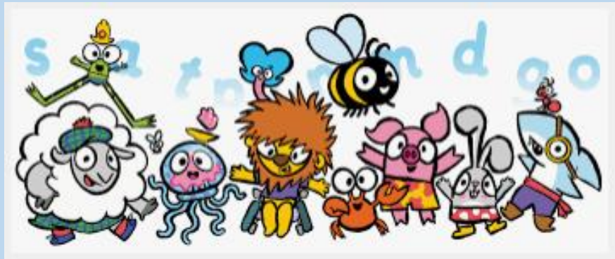
Daily Phonics Session