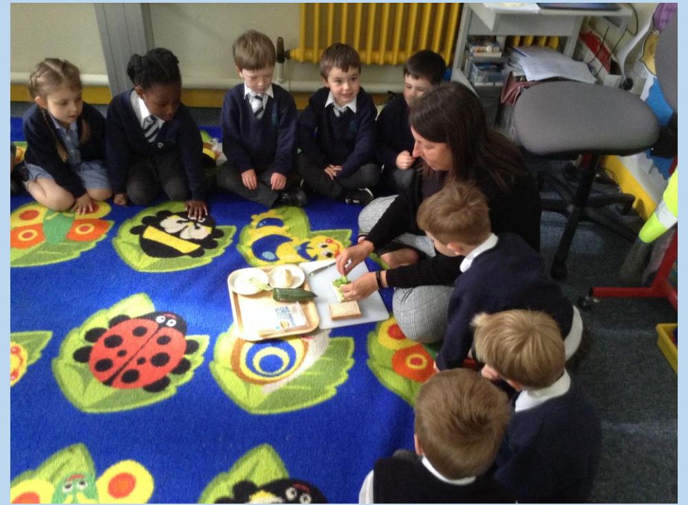
Whole Class Teaching Activities – based on weekly theme.